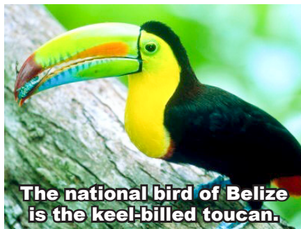
The national bird of Belize is the keel-billed toucan.